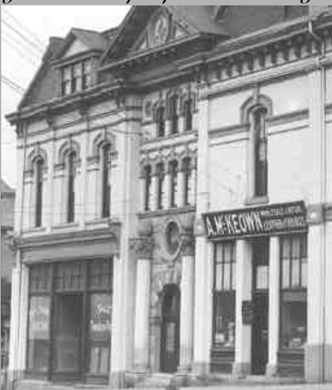
Number three in an occasional series of historical masonic lodge halls: Fisgard Street, Victoria.

Although any member of Grand Lodge is entitled to bring a motion before Grand Lodge, it is historically demonstrated that resolutions brought to the committees by a lodge have a better chance of succeeding. While healthy discussion at the lodge and district level should be encouraged, brethren are reminded of our Constitutions' edict