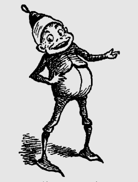
You'll call to mind the days with pride When you proved true though sorely tried