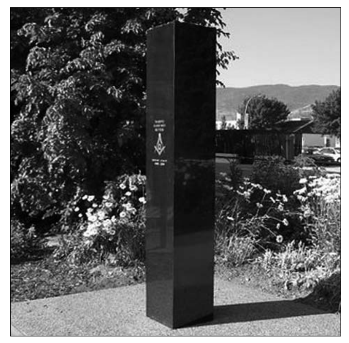
Orion Lodge No 51's centennial legacy project, a square column of ebony granite rising eight feet to its broken top.

immemorial, man has been at war with his fellow man over religious differences yet we as Free and Accepted Masons can sit in lodge, side by side, Jew and Muslim, Catholic and Protestant, sitting in peace and harmony.