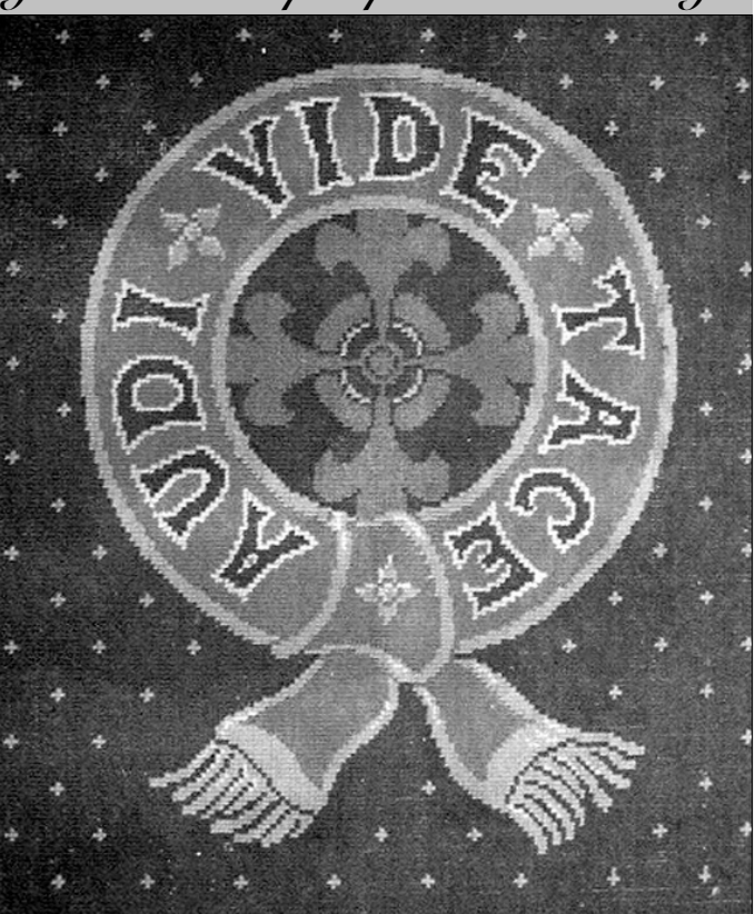
The carpet in Spallumcheen No. 13's lodge hall in Armstrong—depicting the ancient masonic motto, "Audi, Vide, Tace" or "Hear, See, Be Silent" dates from the early 1920s. Your Grand Historian would love to receive high resolution image files of other unique carpets in this jurisdiction.

To receive the Lodge Excellence Award , lodges much accumulate at least thirty-five points, and to receive the