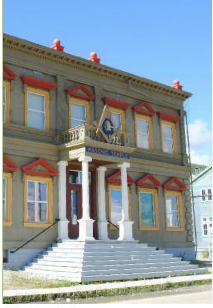
The home of Yukon Lodge 45 in Dawson City recently enjoyed a facelift.

into "alms," but if charity began and ended with a small donation to a beggar, it could not then, conceivably, "extend beyond the grave through the boundless realms of eternity." A man facing any real trouble, regardless of his wealth, is "destitute" indeed. For masonic charity of which this rite speaks is more than alms; it is charity of thought, it is brotherly love, it is help for the helpless. Masonic charity comes first from the heart, then from the